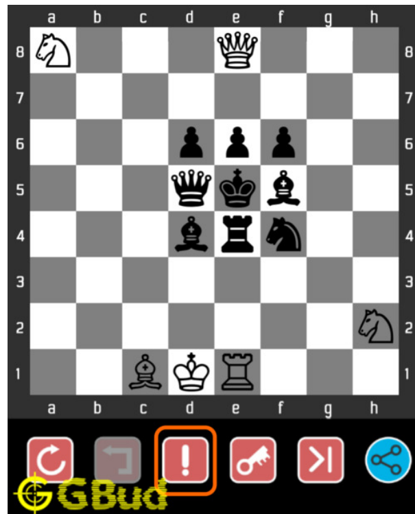
Figure 1.4: Click the help button to get help on next move @ https://gbud.in/g4zk5x1